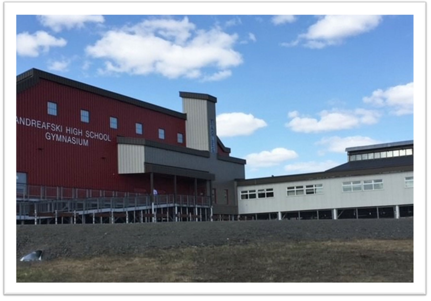
Andreafski High School, St. Mary's, AK